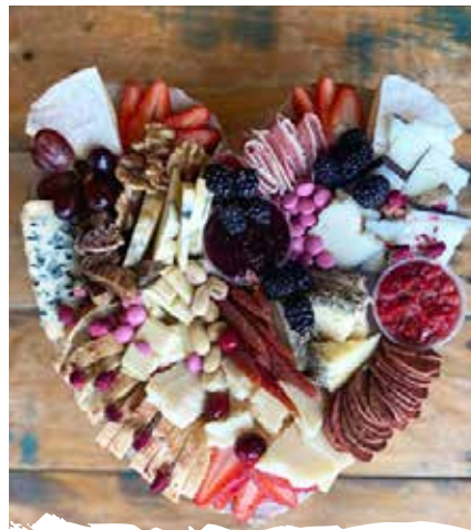
~ HEART BOARDS ~ $100

Impress your guests and add a unique touch to your wedding!