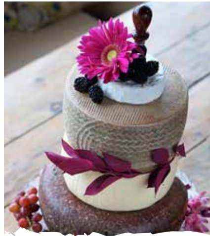
~ CHEESE WHEEL CAKES ~ $250 & UP