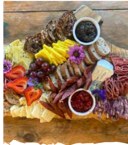
~ CHARCUTERIE BOARDS ~ $80 & UP