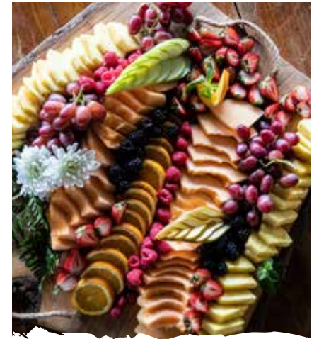
~ FRUIT OR VEGGIE BOARDS ~ $60 Small | $80 Medium | $100 Large