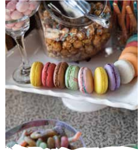
~ CANDY BAR ~ Sweet tooth - $5 per person Sugarplum - $6.50 per person Want it all - $8 per person