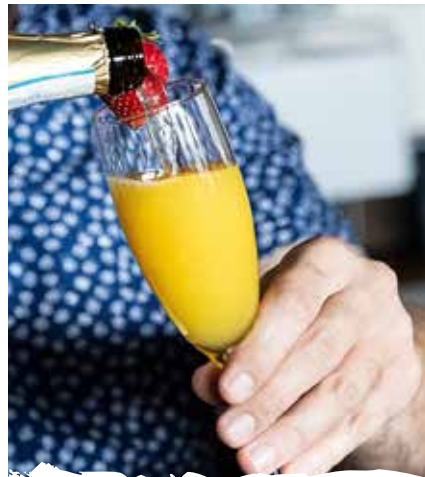
~ MIMOSA BAR ~ $9 per person