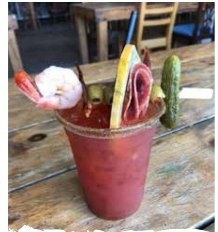
~ CAESAR BAR ~ $11 per person