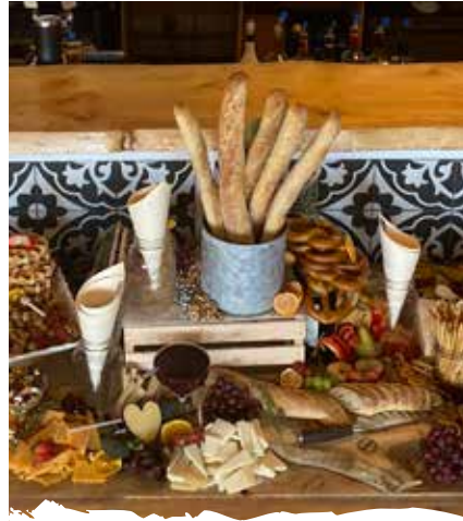
~ GRAZING TABLES ~ $25 per person