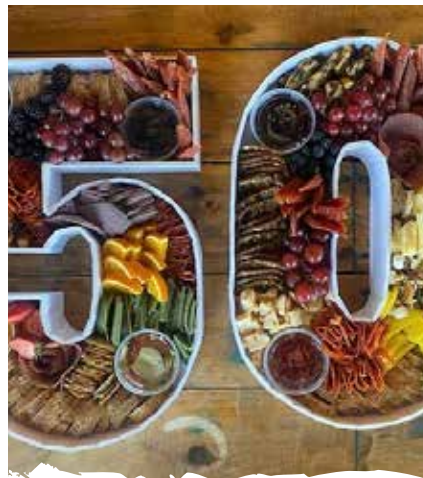
~ MESSAGE BOARDS ~ $50 per 1' Tall Character $75 per 1.5' Tall Character $125 per 2.5' Tall Character