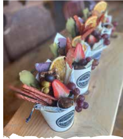
~ INDIVIDUAL CHARCUTERIE CUPS ~ $17 per person