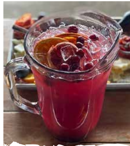
~ SANGRIA BAR ~ $9 per person